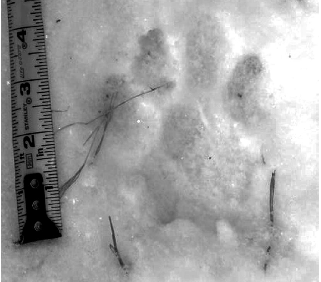
FIGURE 4. Photograph of a Cougar track near Sioux Narrows, Ontario, March 2007. A trapper and a member of the public both observed the Cougar.

in the Deciduous Forest and Great Lakes-St. Lawrence Forest regions, and the southeastern region is primarily in the Great Lakes-St. Lawrence Forest region (Species at Risk 2010b*).