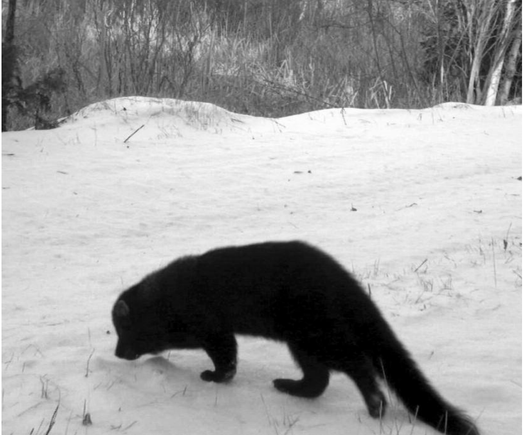
FIGURE 6. Photograph of a Fisher, which is sometimes misidentified as a black Cougar.

Trail cameras were set up across Ontario by OMNR staff to attempt to detect Cougar presence. More than 17 000 camera-nights were accumulated between 1 April 2008 and 31 December 2010. No definitive photographs of a Cougar were acquired during the study; however, one infrared image from a trail camera was assessed to be morphologically similar to a Cougar. Based on the number of photographs of animals taken by the trail cameras (154 736), the probability of taking a photograph of a Cougar on a trail camera in Ontario during the period 2006 to 2010 was close to zero.