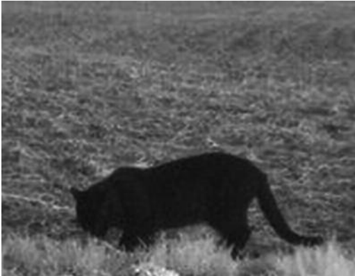
FIGURE 2. Photograph of a melanistic Jaguar ( Panthera onca ) taken by a trail camera near Guelph, Ontario, in April 2010.

has been submitted to the Canadian Field-Naturalist for possible publication.