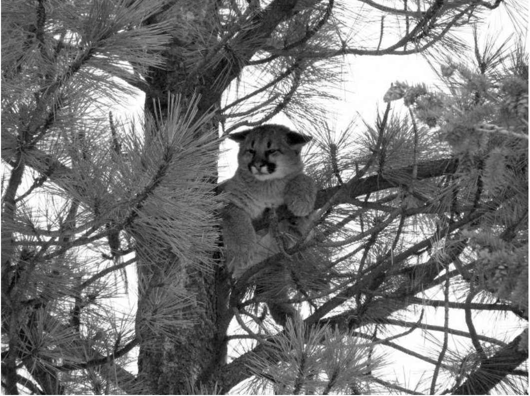
FIGURE 7. Photograph of a treed Cougar west of Great Falls, Montana, taken in February 2009.

has a White-tailed Deer population estimated to be between 400 000 and 500 000 (Bellhouse and Rosatte 2005).