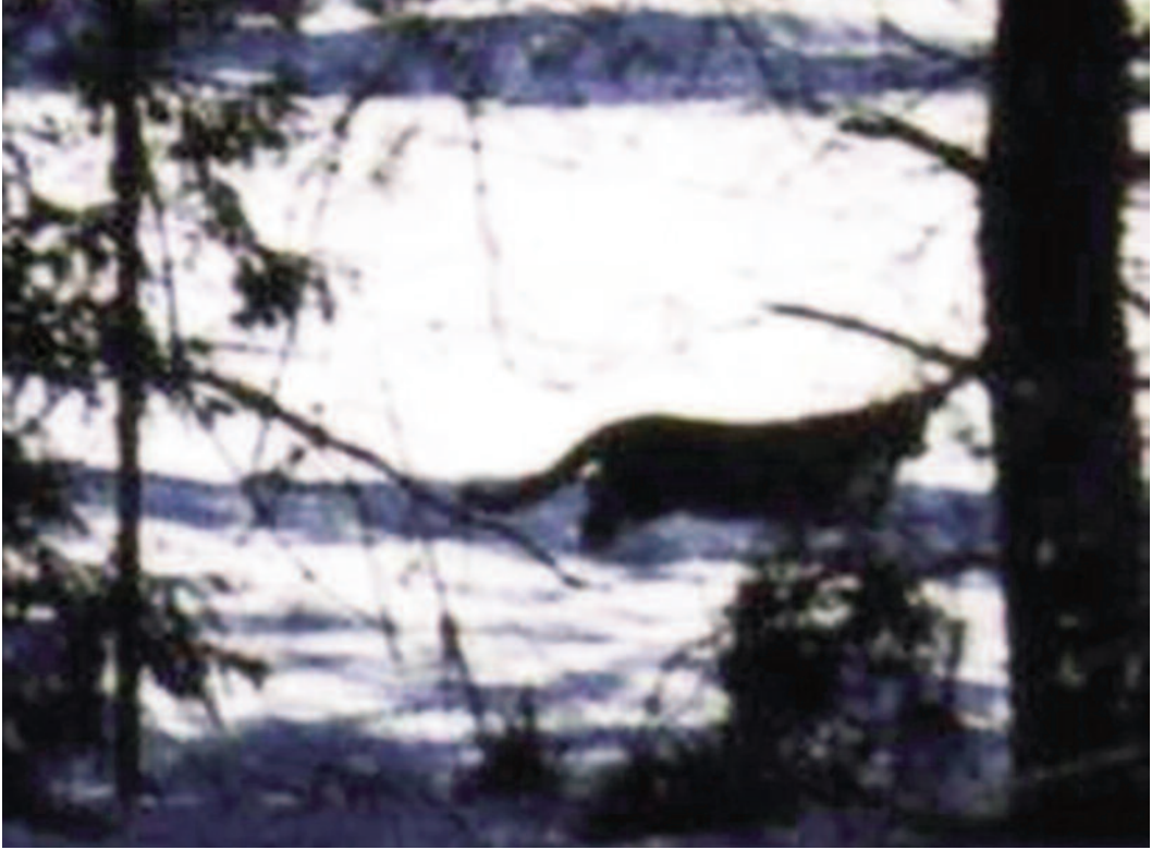
FIGURE 5. Photograph of a Cougar in the Orillia area near Coldwater, Ontario, in March 2007. S. Kenn of the Ontario Puma Foundation did an on-site investigation and determined that the photograph was authentic.

logical features of a Cougar; and one photograph of a Cougar from the Gowganda area (northeastern region) that was confirmed to be consistent with a Cougar.