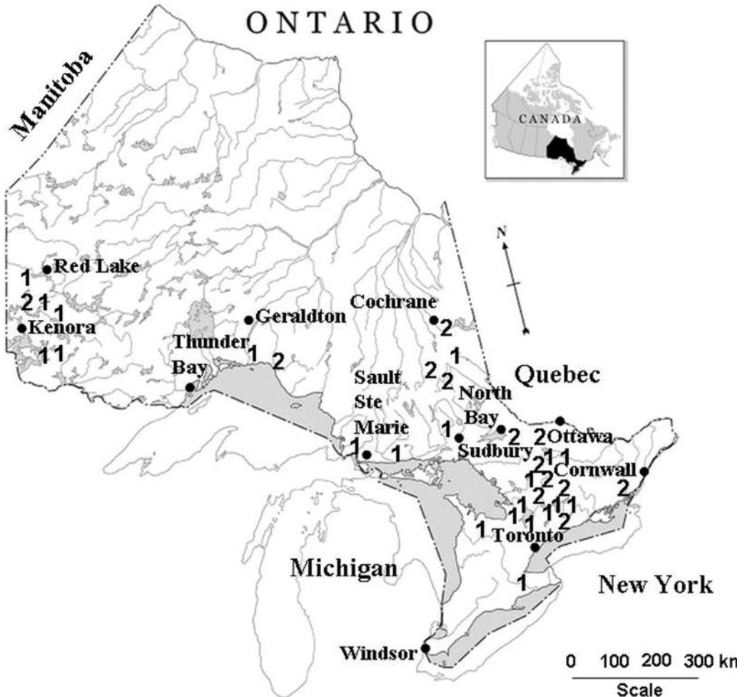
FIGURE 3. Location of class 1 and class 2 evidence of Cougars in Ontario during the period 1991 to 2010. 1 = class 1 evidence (scat and DNA); 2 = class 2 evidence (sightings by a professional biologist). Locations are approximate.

For the purposes of reporting evidence, the province was divided into four regions—northwestern Ontario (NWO), northeastern Ontario (NEO), southwestern Ontario (SWO), and southeastern Ontario (SEO). The northwestern region approximated an area bounded by Red Lake, Geraldton, Sault Ste. Marie, and Thunder Bay (Figure 3). The northeastern region included the approximate area within the perimeter defined by Long Lac, Cochrane, North Bay, and Blind River. The southwestern region included the perimeter defined by Toronto, Windsor, Owen Sound, and Barrie. The southeastern region included the area within the perimeter defined by Parry Sound, Oshawa, Cornwall, and Pembroke. The northwestern and northeastern regions are in the Boreal Forest and Great Lakes-St. Lawrence Forest regions. The southwestern region is