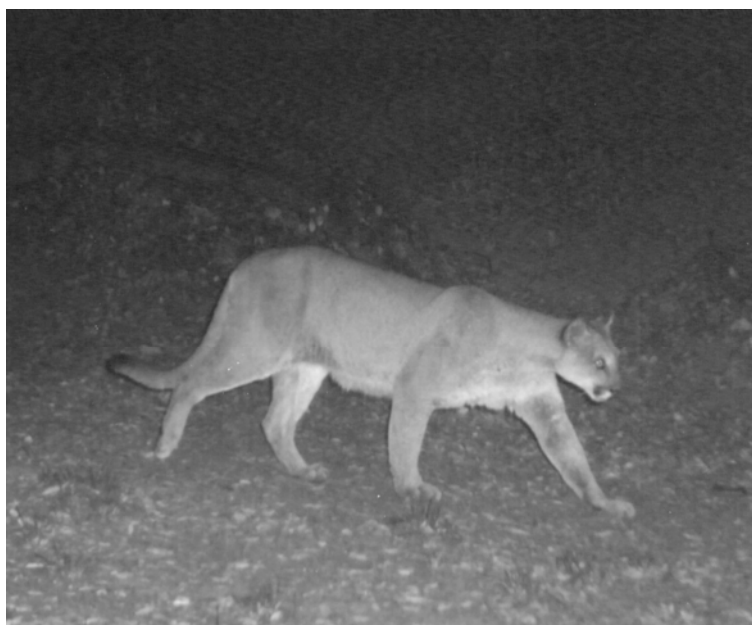
One of the unconfirmed trail cam photos from south-central Louisiana, Spring 2007.

This Fall, two separate cougar photographs surfaced that were taken by trail cameras 100 miles apart in Louisiana. Maria Davidson of the LDWF examined these pictures and visited the spots where they were taken, suspecting that the cougar pictured might be the same one traveling both areas. After the investigation, the Louisiana Dept. of Wildlife and Fisheries confirmed the evidence as legitimate unaltered proof of a cougar in Louisiana.